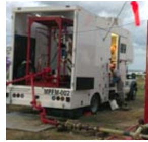
Well testing service