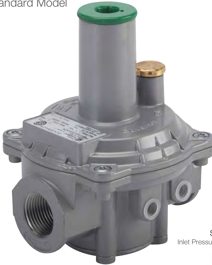
Standard Model Inlet Pressure Range: 3" W.C. to 2 PSIG